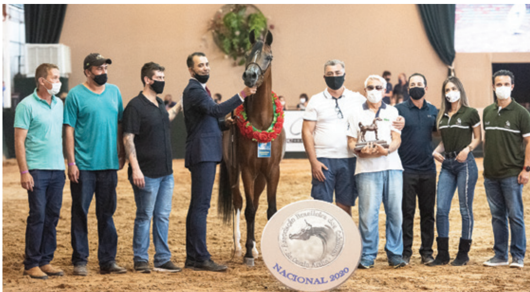
Bronze Champion Colt, Virtus HEC, from Haras e Estância Califórnia

ANOTHER INTENSE COMPETITION WAS THE COLT CHAMPIONSHIP. Gold Champion Ragnary GV was awarded 3 first places and 2 second places. Silver Champion Prince Magnum JSZ was awarded 2 first places, 1 second place and 2 third places. The balanced and typical Ragnary was also awarded the Male Most Classical Head in this version of the Nationals. He inherits these characteristics from his father Ragnar Rach, Three-time Male Most Classical Head Champion in Brazilian Nationals and who this year was awarded Get of Sire Champion. Ragnary GV's mother is AF Hanolina, daughter of Delmar Rach, a key sire in Brazilian breeding in the 1990s/2000s, from the blood line of Marsianin by Aswan, Aladdin and Bask. He was bred by Haras Gran Via