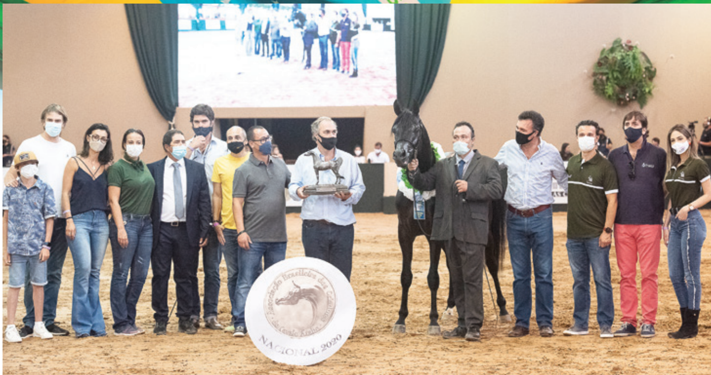
Silver Champion Young Colt, Aswad, from Haras Dona Francisca and Panquehue