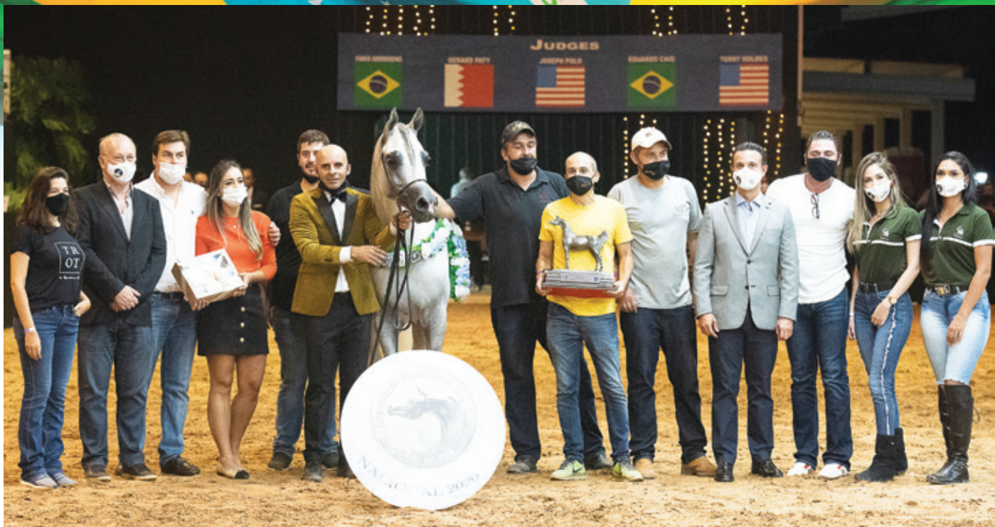
Silver Champion Stallion, FT Saeed, from Haras FT