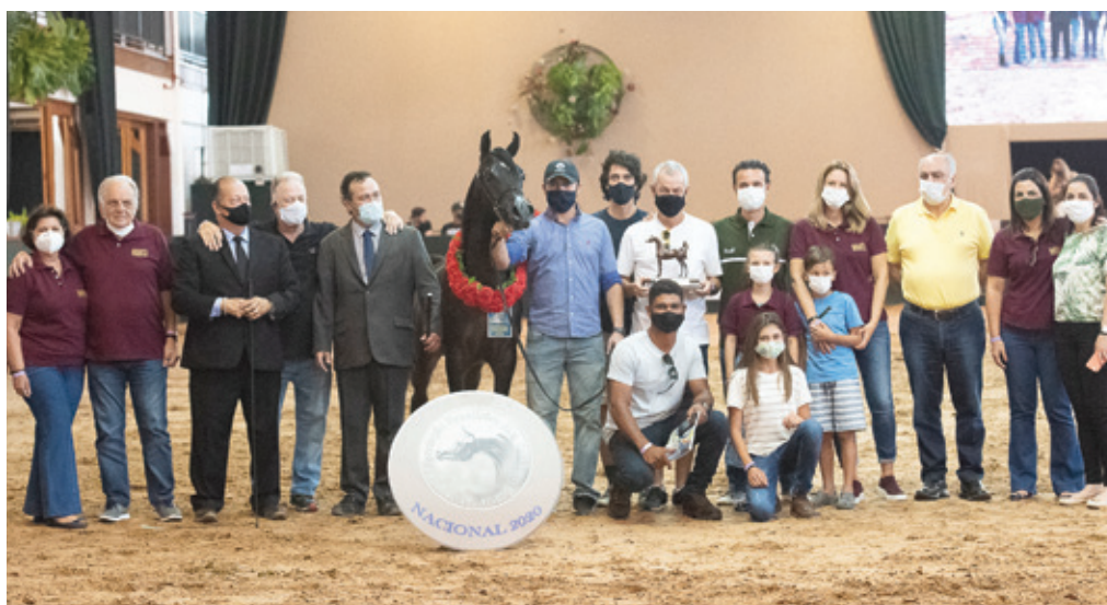
Bronze Champion Jr. Colt, RFI Petrus HPA, from RFI Arabians