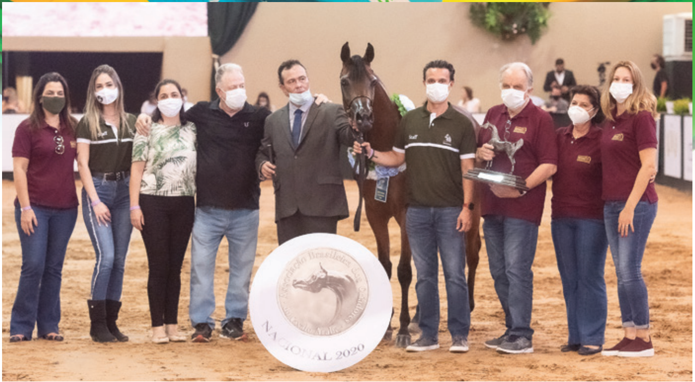
Silver Champion Young Filly, RFI Raffaella, from RFI Arabians