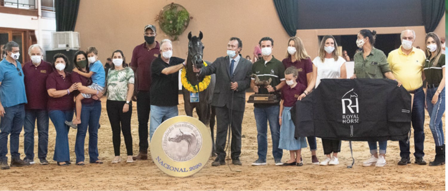
Gold Champion Jr. Colt, RFI Fiorano, from RFI Arabians