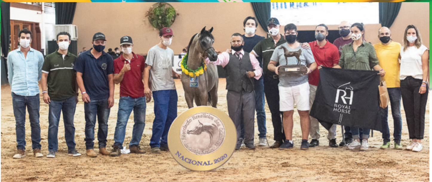
Gold Champion Yearling Filly, HDF Fontonella, from Haras das Faias