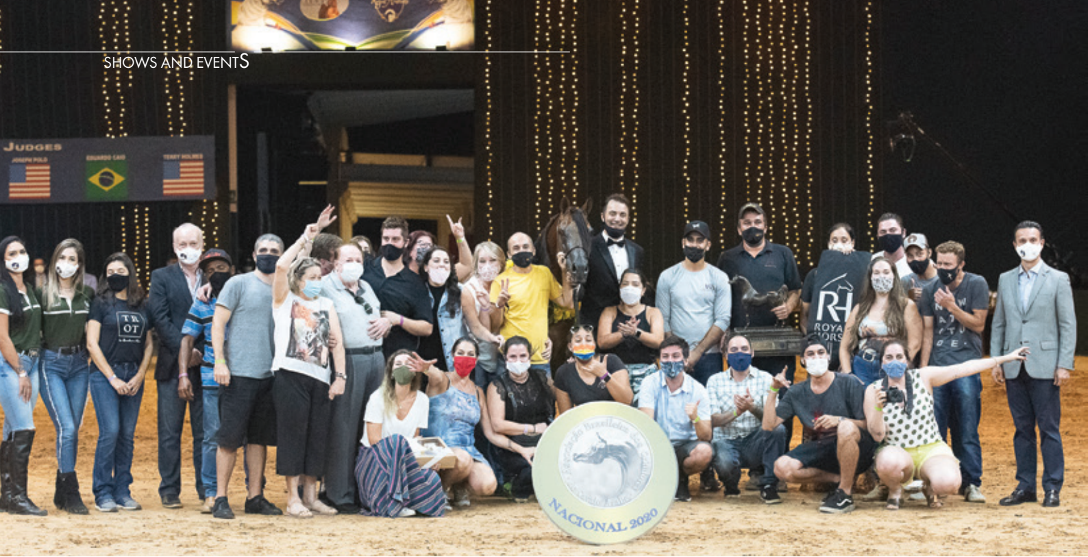
Gold Champion Stallion, Falak FK, from Haras FK