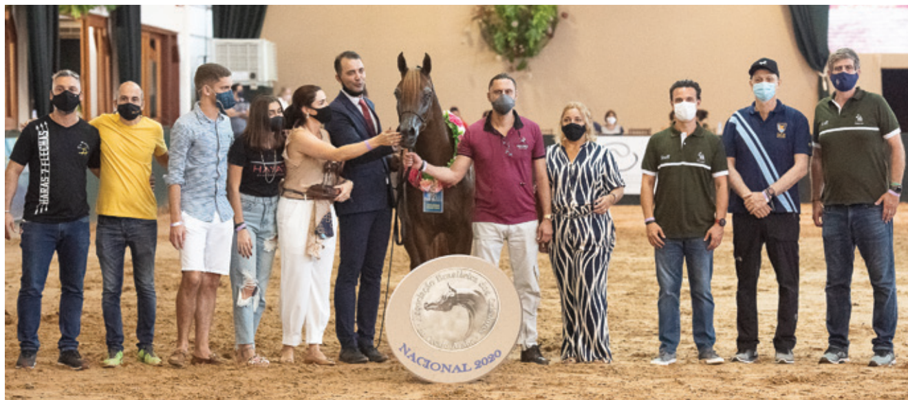
Bronze Champion Filly, Fontanella Al Hayat, from Haras Hayat