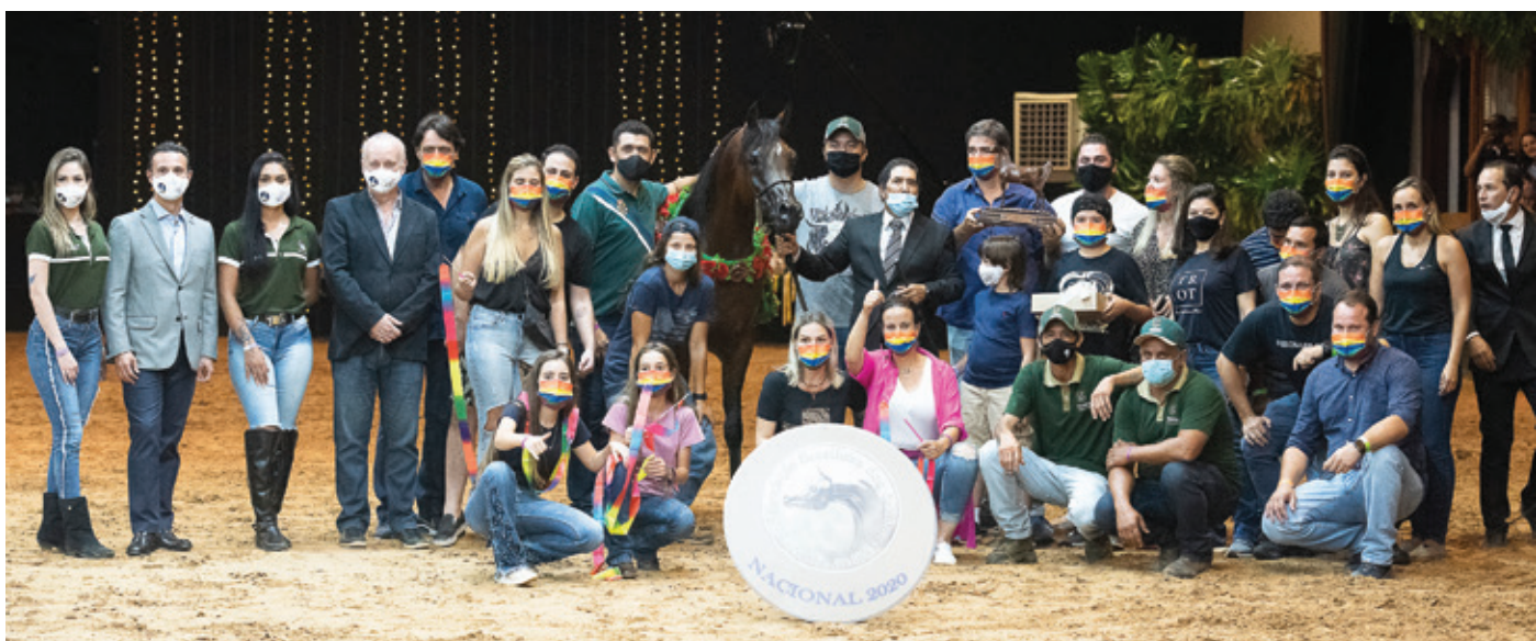
Bronze Champion Stallion, TS Rainbou, from Haras Arco Azul

EL TINO IS THE SIRE OF NATIONAL GOLD AND SILVER STALLION NATIONAL CHAMPION. With 4 first places and a second of judges Falak FK won the Gold. He is son of El Tino (Valentino) out of Argentine mare Fogosa HAB by JJ Fuego Sureño (Magum Psyche), bred and owned by Haras FK. Falak had an extensive and impressive ring career: Junior Colt in 2005, Young Colt in 2016, Young Stallion in 2018, and now Gold Stallion Champion. So far, he has only three registered offspring, all born this year. Falak has great breeding potential and should be directed to mating, taking into account its powerful blood