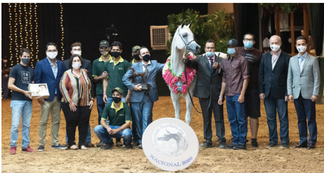
Bronze Champion Mare, RP Joharra, from Haras Vila dos Pinheiros