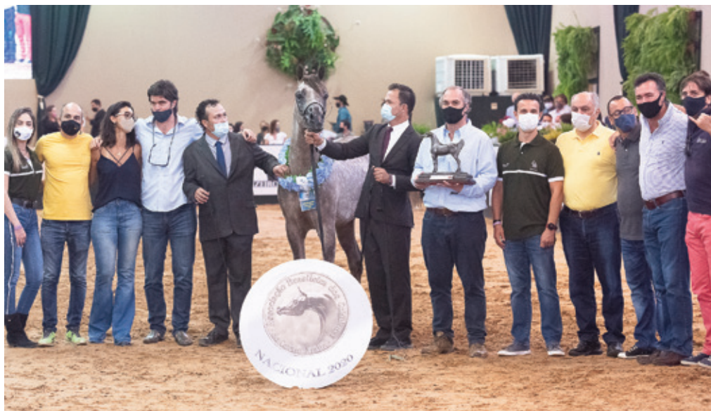
Silver Champion Jr. Colt, HP El Zar, from Haras Panquehue