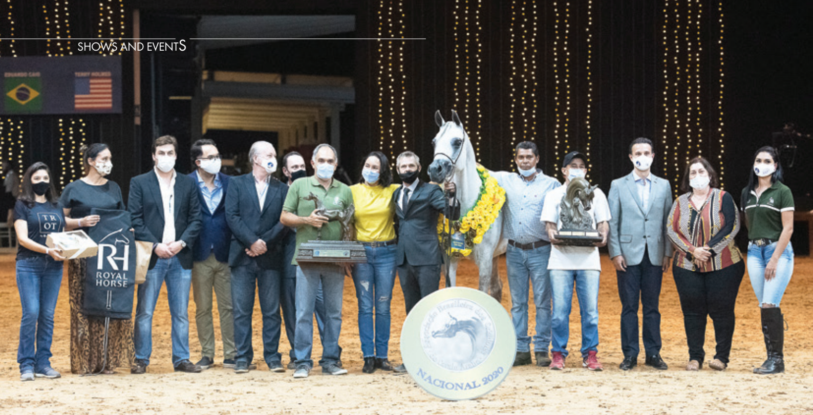
Gold Champion Mare, Sahara Saleemah, from Haras Sahara