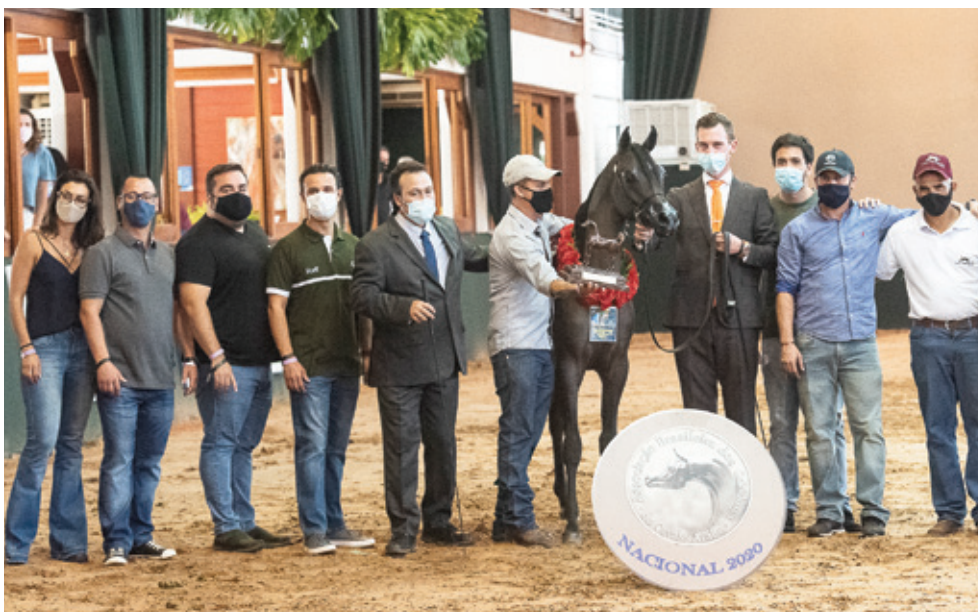
Bronze Champion Yearling Colt, Axell, from Rancho Oliveira Arabians