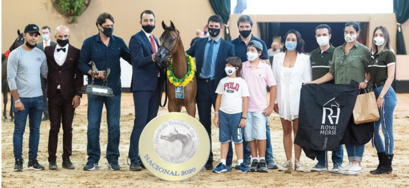
Gold Champion Yearling Colt, Oppus One Arabco II, from Rancho Arabco