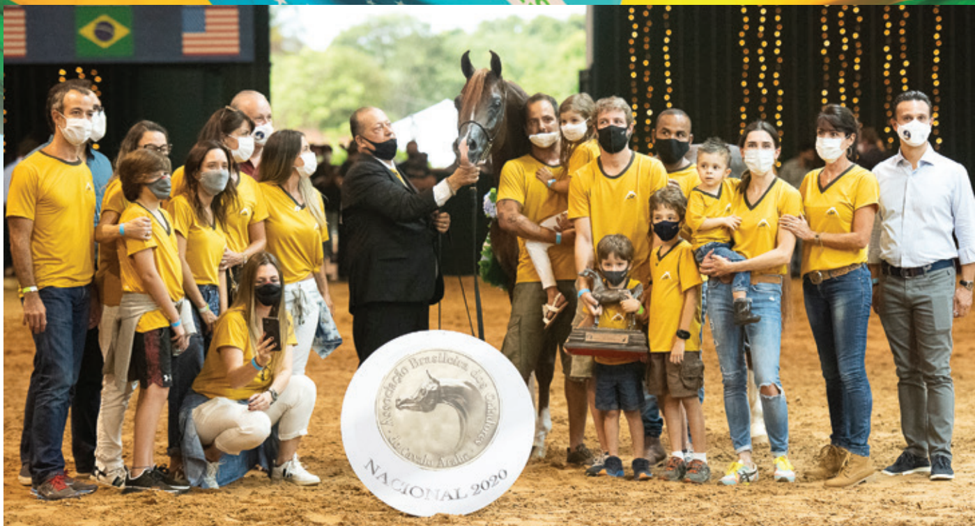
Silver Champion Young Stallion, Abbas Al Ventur, from Al Ventur Arabians