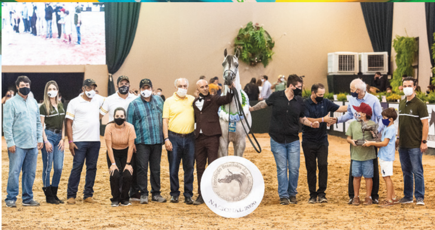
Silver Champion Colt, Prince Magnum JSZ, from Haras JM