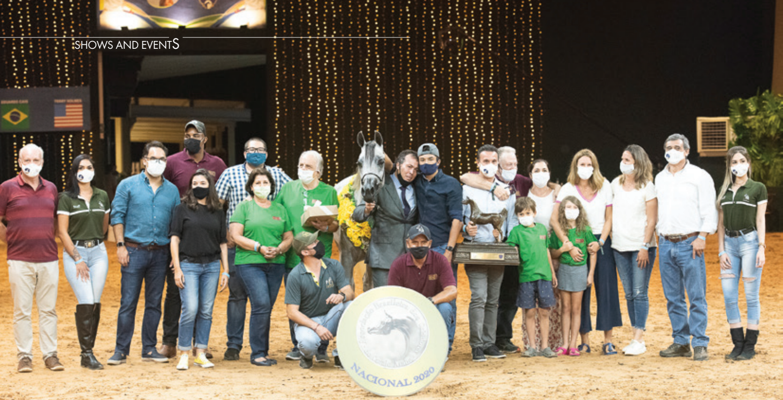
Gold Champion Young Mare, RFI Sawari, from RFI Arabians