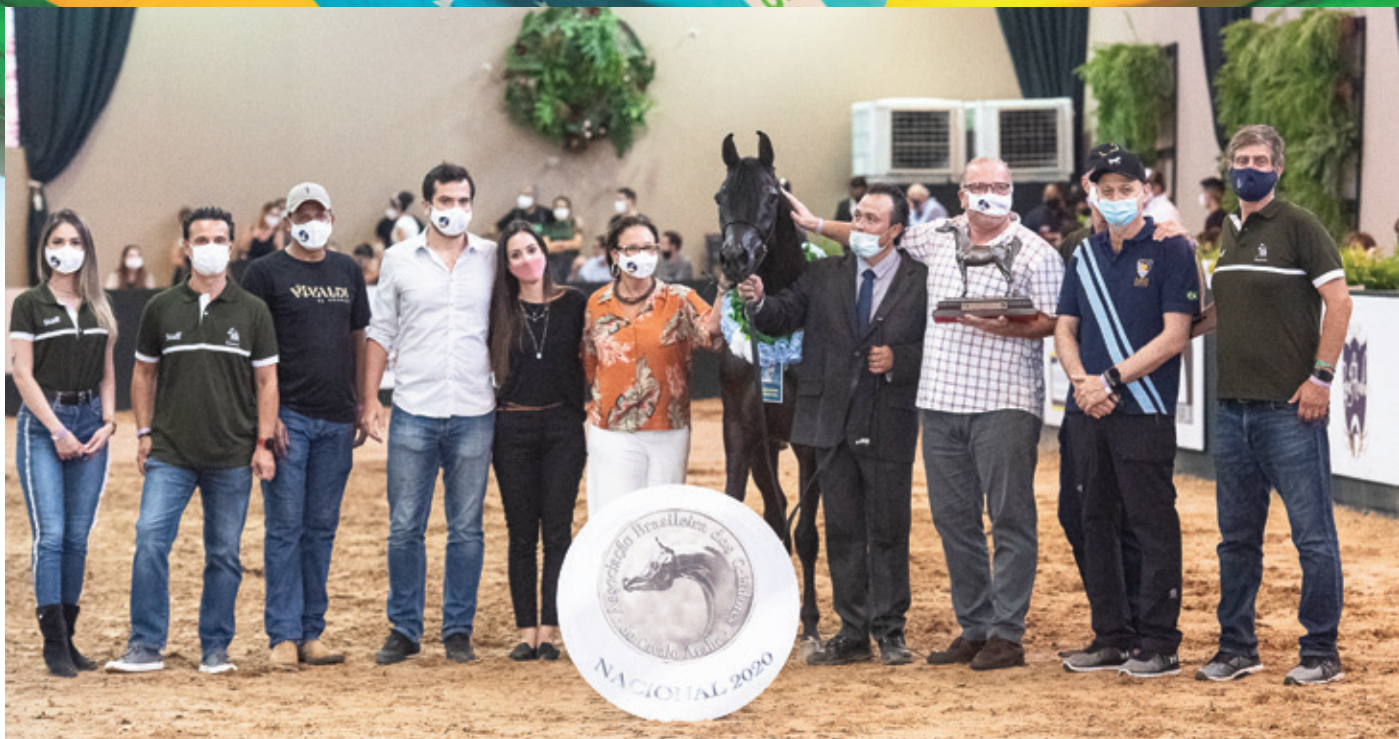
Silver Champion Filly, Maria AL, from Haras Canaã