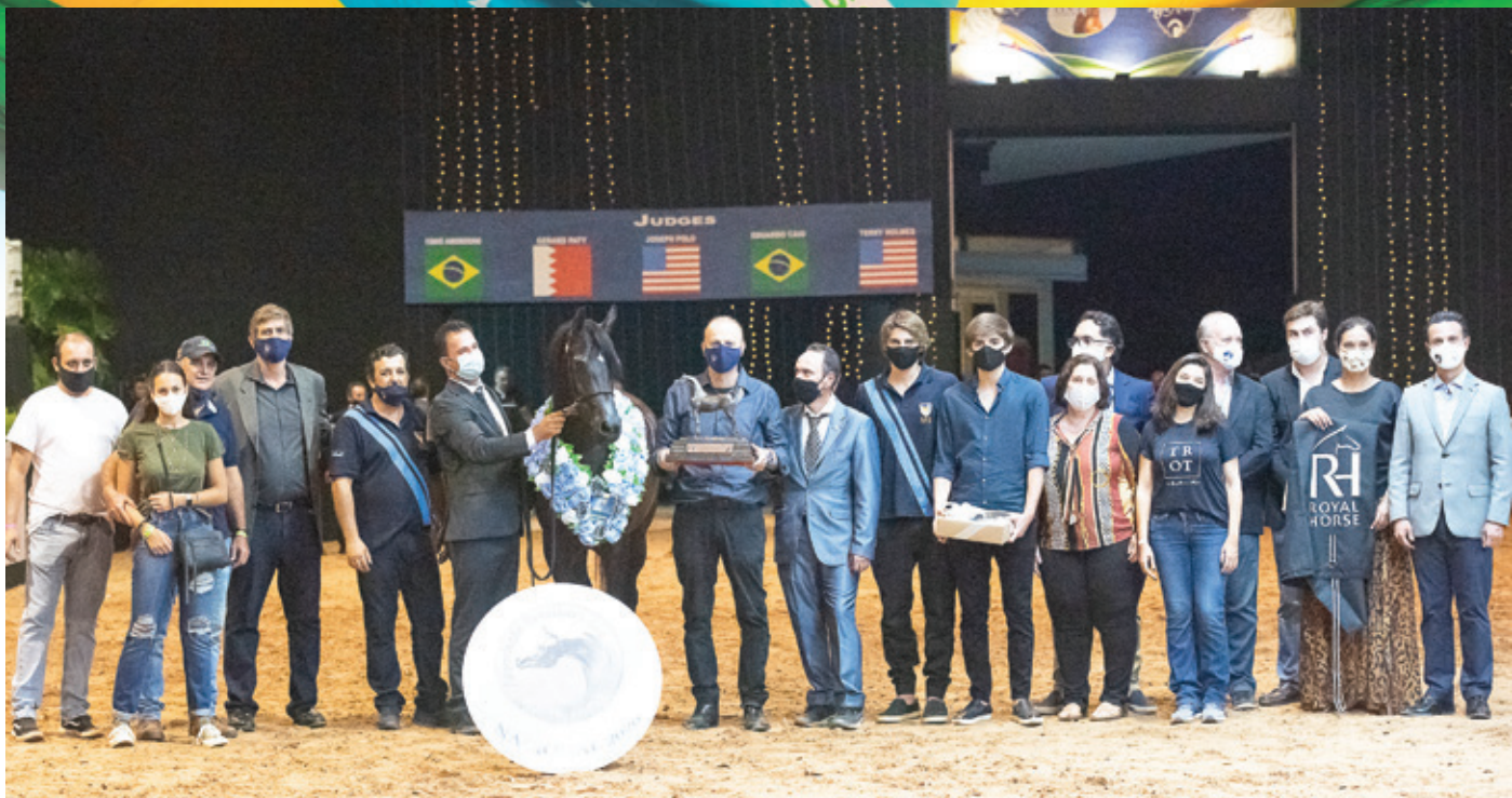
Silver Champion Mare, Vaidosa Rach, from Rach Stud