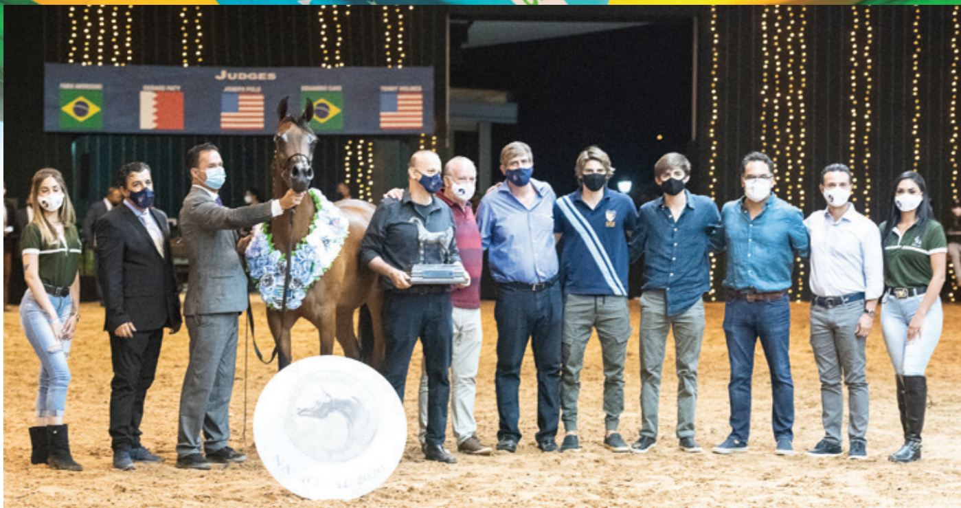
Silver Champion Young Mare, Preferida Rach, from Rach Stud