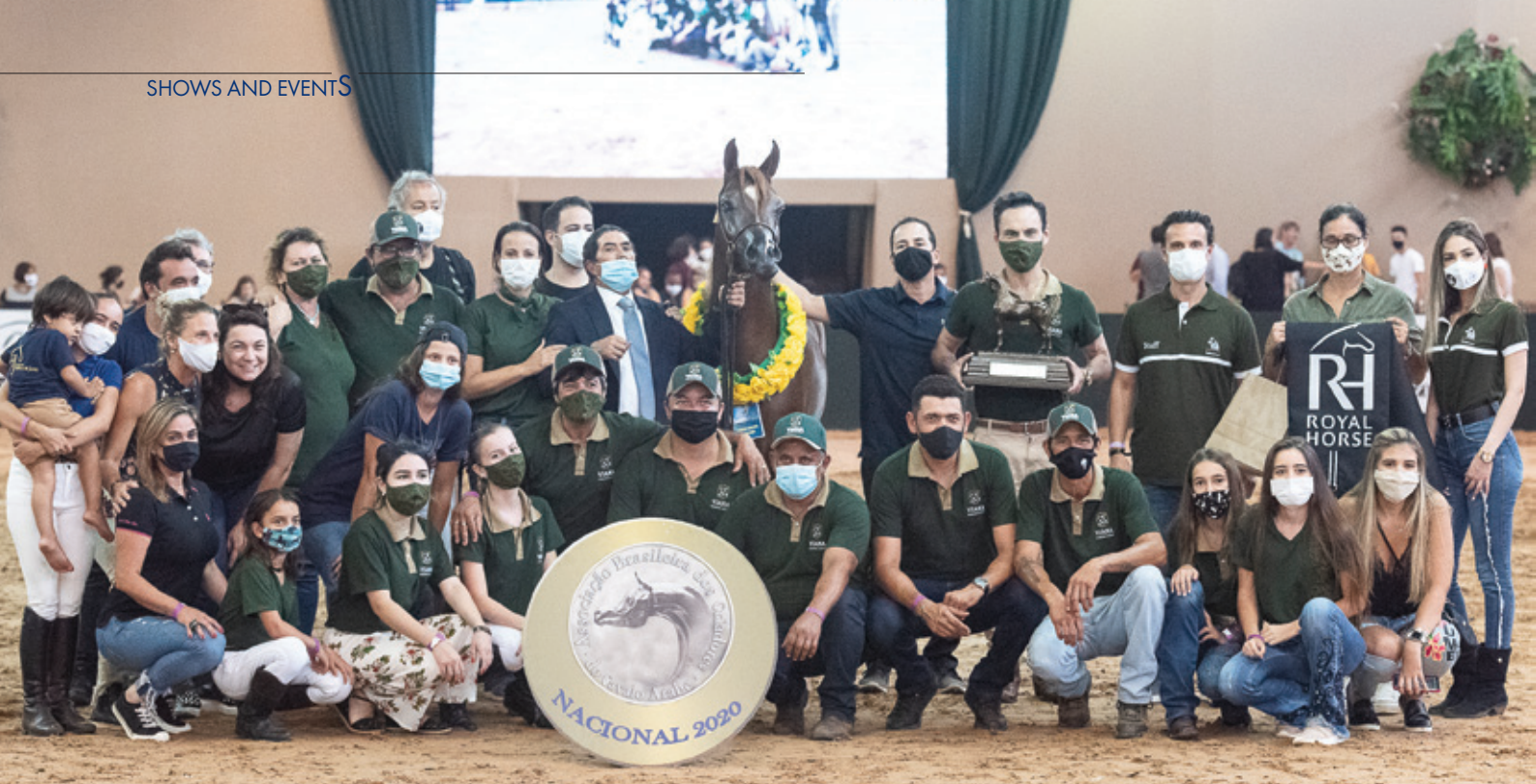
Gold Champion Colt, Ragnary GV, from Viana Arabian Horse