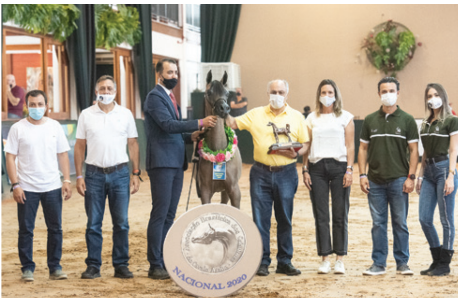
Bronze Champion Yearling Filly, Saphiraa JSZ, from Haras Santa Marta