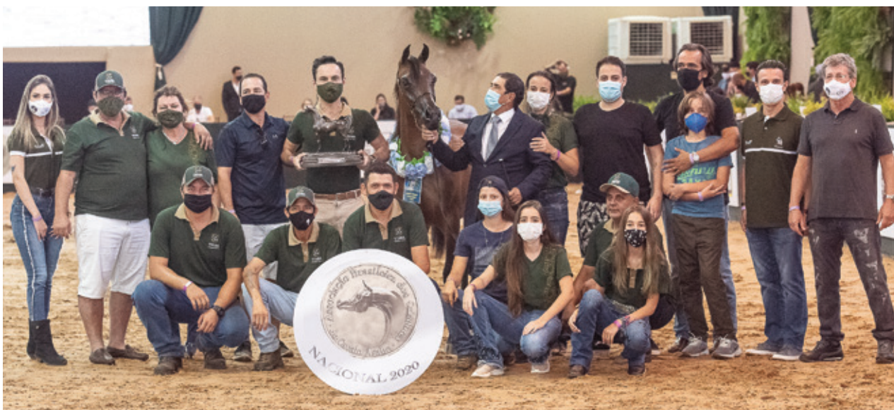
Silver Champion Jr. Filly, VV Shaffire, from Haras Viana Arabian Horse