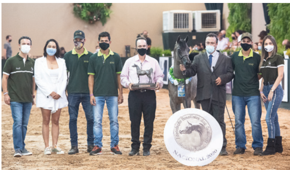
Silver Champion Yearling Colt, Lughan HVP, from Haras Vila dos Pinheiros