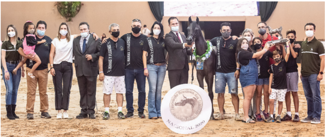
Silver Champion Yearling Filly, Iza 7F, from Haras 7 Flechas