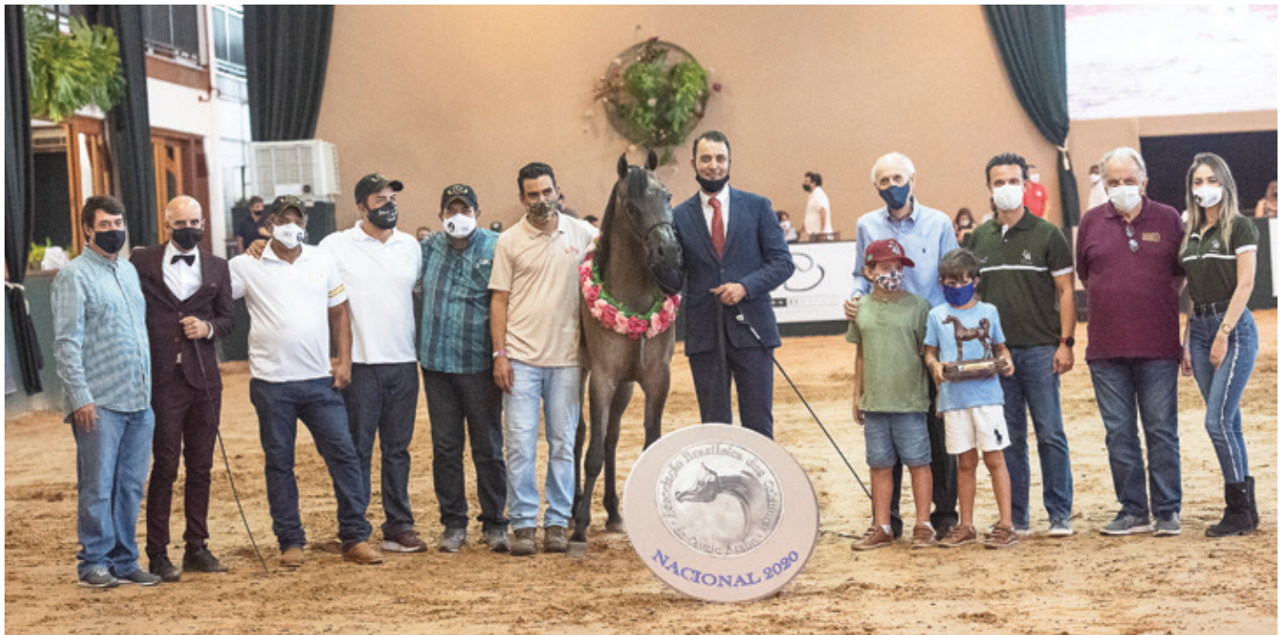
Bronze Champion Young Filly, Endless Love JM, do Haras JM