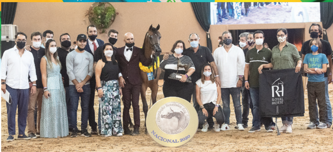
Gold Champion Jr. Filly, Keishah Bint Lami RB, from Haras das Cascatas